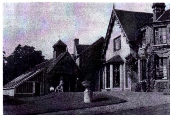
Croquet at Flitwick Manor in the late 1870s

Chapter 4 covers 'The Model Estate 1816–36'. The manor house before Tom Brooks is described and also from when Tom took over in 1816, as are the improvements he made – a music room with an organ of 448 pipes and a further 175 swell pipes; a mainly natural history museum; an armoury and plant houses. A kitchen garden was created in 1818 and a Prospect Tower in 1825. The road which ran between the house and the church was diverted to the north of the church and the old road to Westoning which was closed in 1808 by the enclosure became a grand avenue of Chestnut trees most of which still survive. There is much on the lodges, gardens, including a botanic garden, and produce. Improvement costs are looked at and Tom's accounts for 1836 are reproduced and examined. There are sections on the costs of capital work from 1825–32, and the Flitwick Riot of 6 December 1830, related to the earlier national 'Captain Swing' disturbances. Indoors and outdoors servants and methods of travelling are considered. The comments of visitors to the estate are recounted and there is a tailpiece on the Brooks arms – never authorised by the College of Heralds.